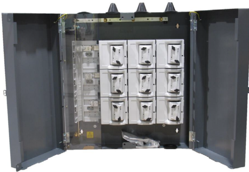
3 way Sub Mains Distribution Board shown

Indoor surface mounting sub mains distribution boards which accept a single incoming 3 phase supply up to 630A having 2, 3, 4, 5 or 6 triple pole outgoing BS 88 J type fuse ways with 92mm centres. Configured for direct (single cable) connection of incomer to main busbar.