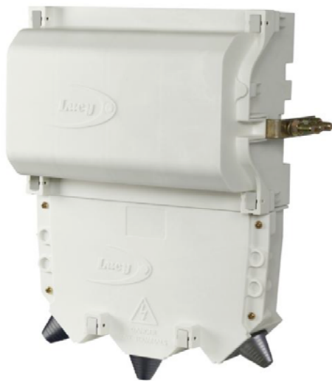
200A HDCO with cable trough

All insulated Heavy Duty Cut-out with three in-line BS 88 J type slotted tag fuse links for indoor installation.