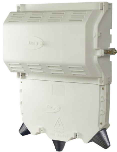
400A HDCO with cable trough